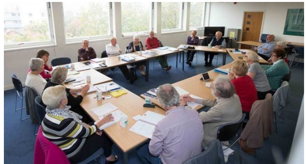
NEC meeting minutes are published on the national website

The regional website is at https://u3ani.info/